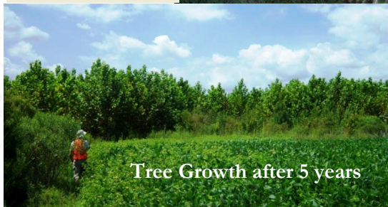
Tree Growth after 5 years