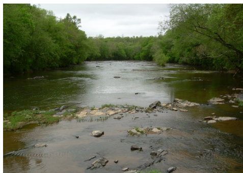
Restoring the Natural Systems of our State.

Developing landowner partnerships is the foundation for successful environmental restoration. We are committed to working with landowners to achieve mutual objectives on our projects. Through this investment, both landowners and the environment realize benefits.